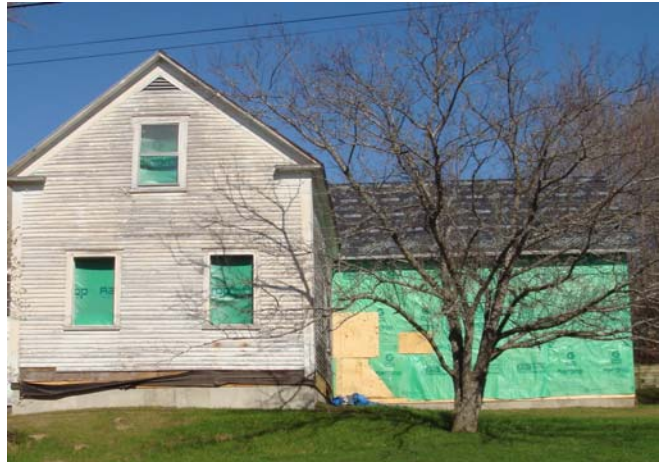
Perkins House with barn under reconstruction as viewed from Maple Hill Road, May 2007